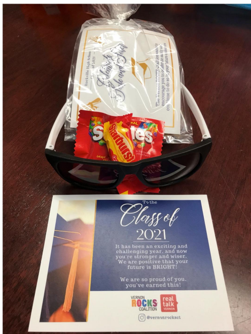
Goodie Bags handed out at Rockville's graduation