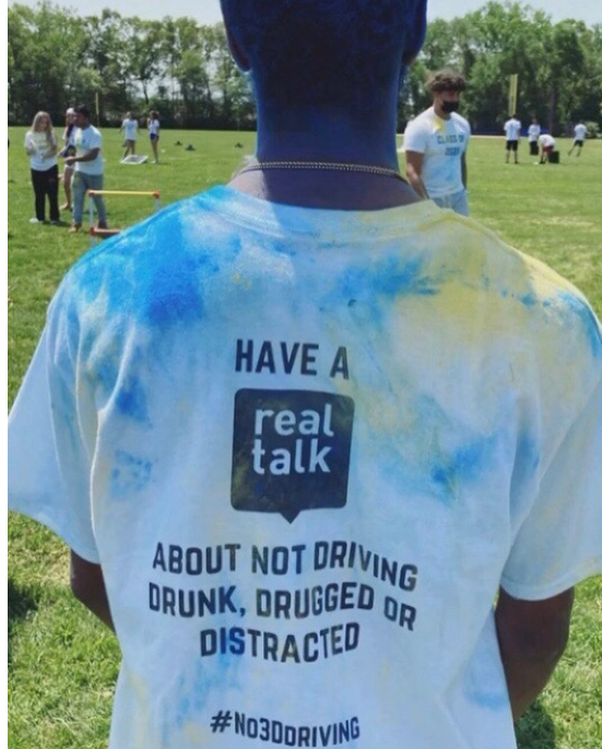
The back of the tee shirts given out at RHS's Senior Field Day