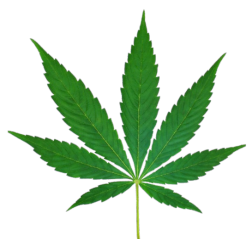
New CT Cannabis Legalization Laws

Connecticut's legalization of adult recreational cannabis use has opened up many questions for regarding driving, possession, advertising and more.